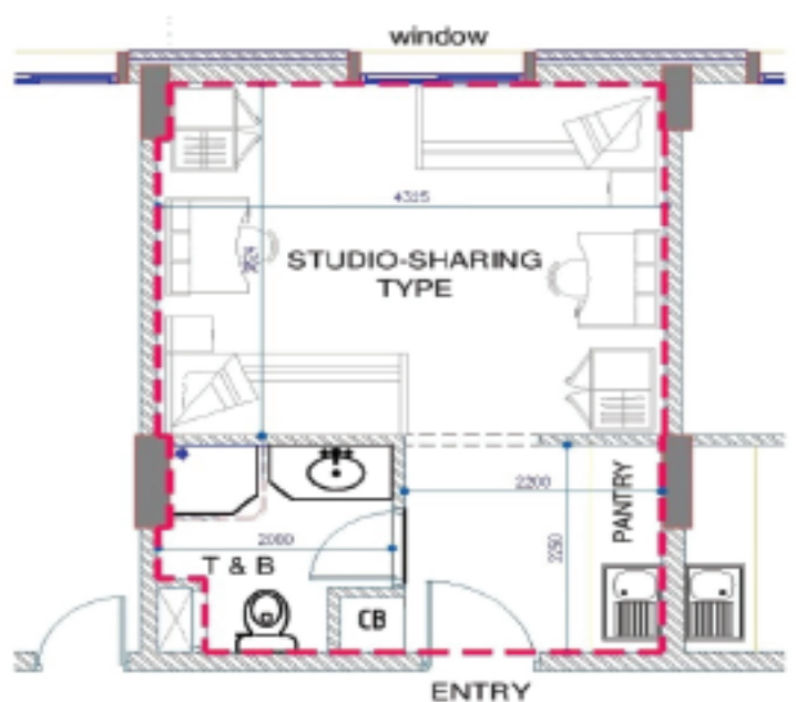
2-SHARING BEDROOM - TYPE 1 TOTAL AREA 26 M2